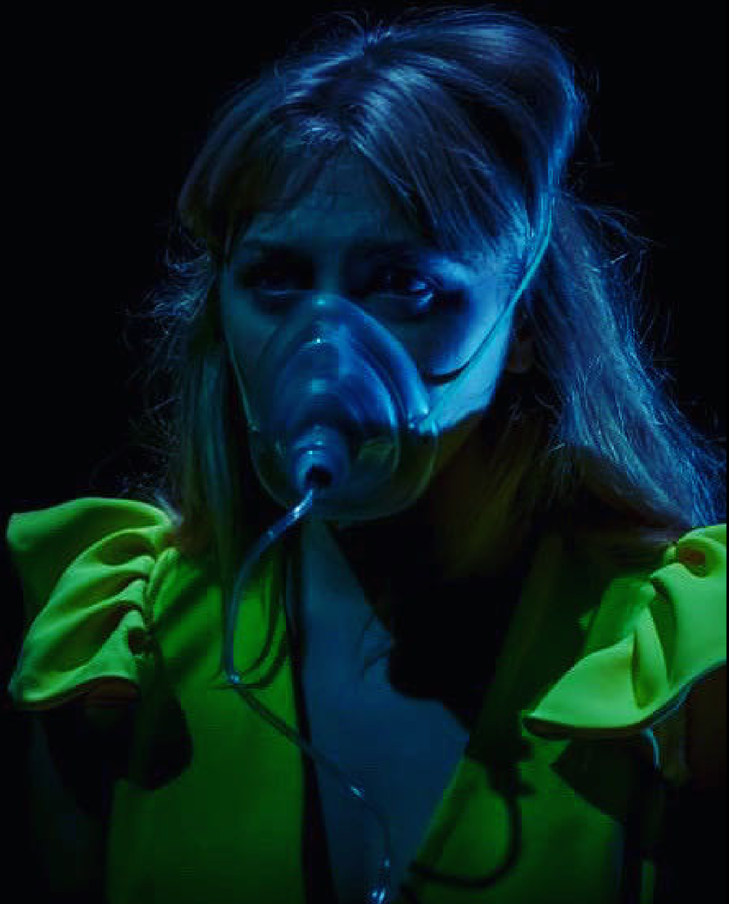
IMAGE OF AN UNKNOWN YOUNG WOMAN